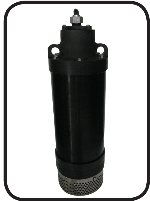
Submersible Dewatering 2" NPT & 3" NPT Female

Following a series of processes, ending in a controlled bake, the winding is 100% impregnated and sealed. VPI is greatly superior to the "dip and bake" method which may provide only 50% to 70% of effective insulation leaving voids and air pockets. VPI provides 100% solid mass structure which provides the greatest mechanical strength and a cooler running motor due to superior heat dissipation.