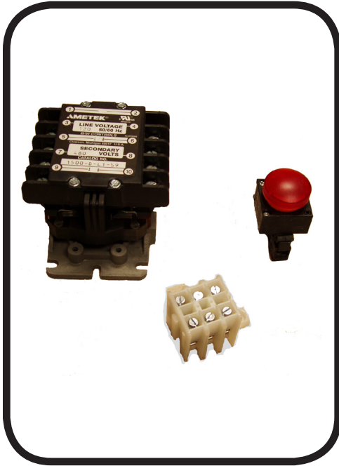
Seal Leak Sensor Relay Kit