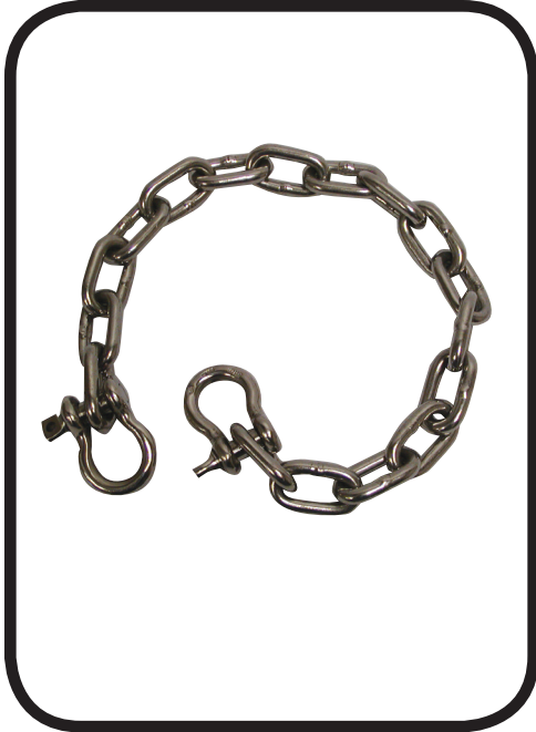
Lifting Chain & Shackle Kits

Model: PF316-10K, PF250-10K Lifting Chain PF0400POK, PF0600POK, PF0800POK Pull-out Flange Kits